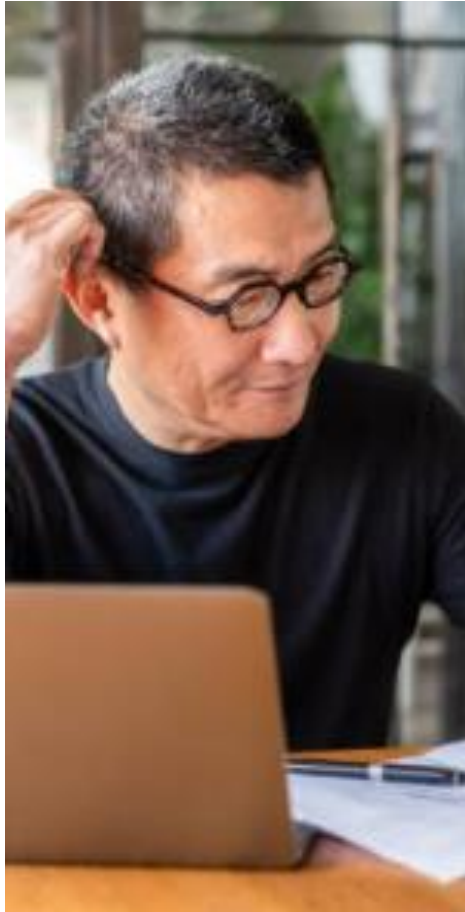
Original Medicare (Parts A & B)